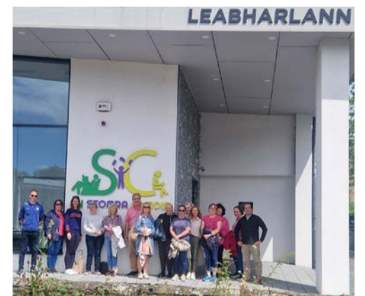
A group of primary school teachers on a history tour of the town.

Have you visited your local library recently? It's a great place to relax, browse, study and avail of our computer and print facilities.