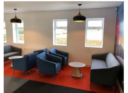
The Social Area at Mohill Enterprise Centre

Phone 071 9651000 & keep an eye on our website and Facebook page for regular updates and information.