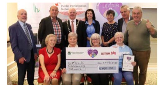
Members of Mohill Community Network receiving their award from Leitrim County Council

Congratulations to members of Mohill Community Network who won the top prize in the Love Where You Live Competition run by Leitrim County Council in the Cleaner Greener Category.