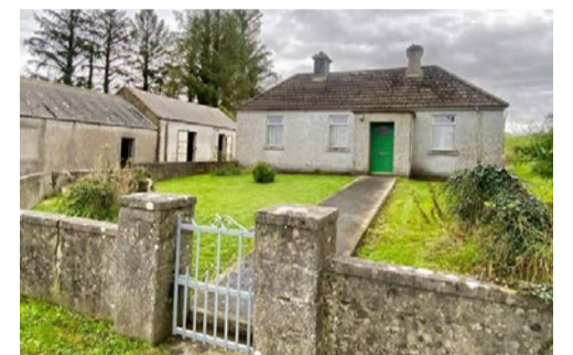
Example of a house that is availing of the Vacant Property Refurbishment Grant

The Vacant Property Refurbishment Grant provides funding for owners to refurbish vacant and derelict homes. It can also be used to renovate vacant commercial properties that have not been used as residential properties before.