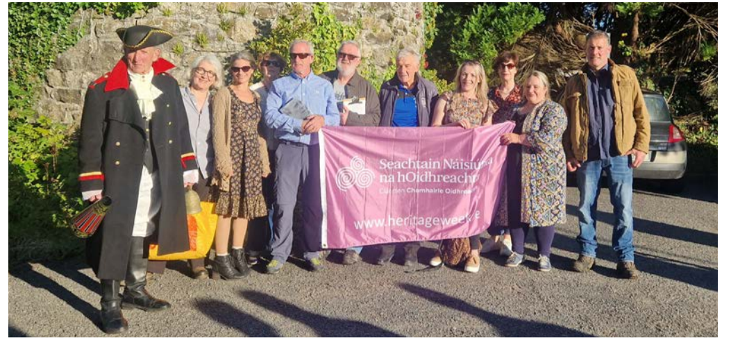
Participants and Contributors taking part in Heritage Week event "The Half of the Moon and the Whole of the Hill" Discovering Mohill through its Music, Songs, Poetry and Stories.

Congratulations to Mohill Historical Society who won the award for best event in County Leitrim during Heritage week. The award, from the Heritage Council, was for the "The Half of the Moon and the Whole of the Hill - Discovering Mohill through its Music, Songs, Poetry and Stories".