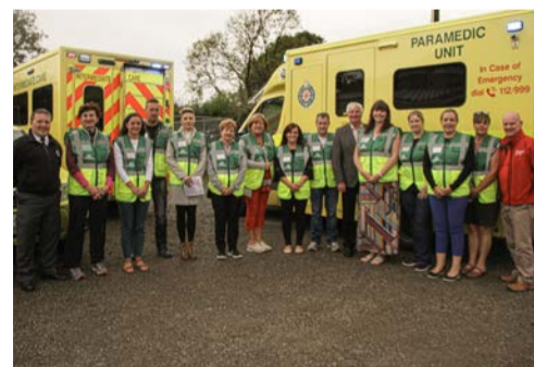
Eslin Community Responders

This is a group of volunteers who are trained to respond to emergency calls in the Eslin/Drumsna/Mohill area. The community is fortunate to have these people available when needed.