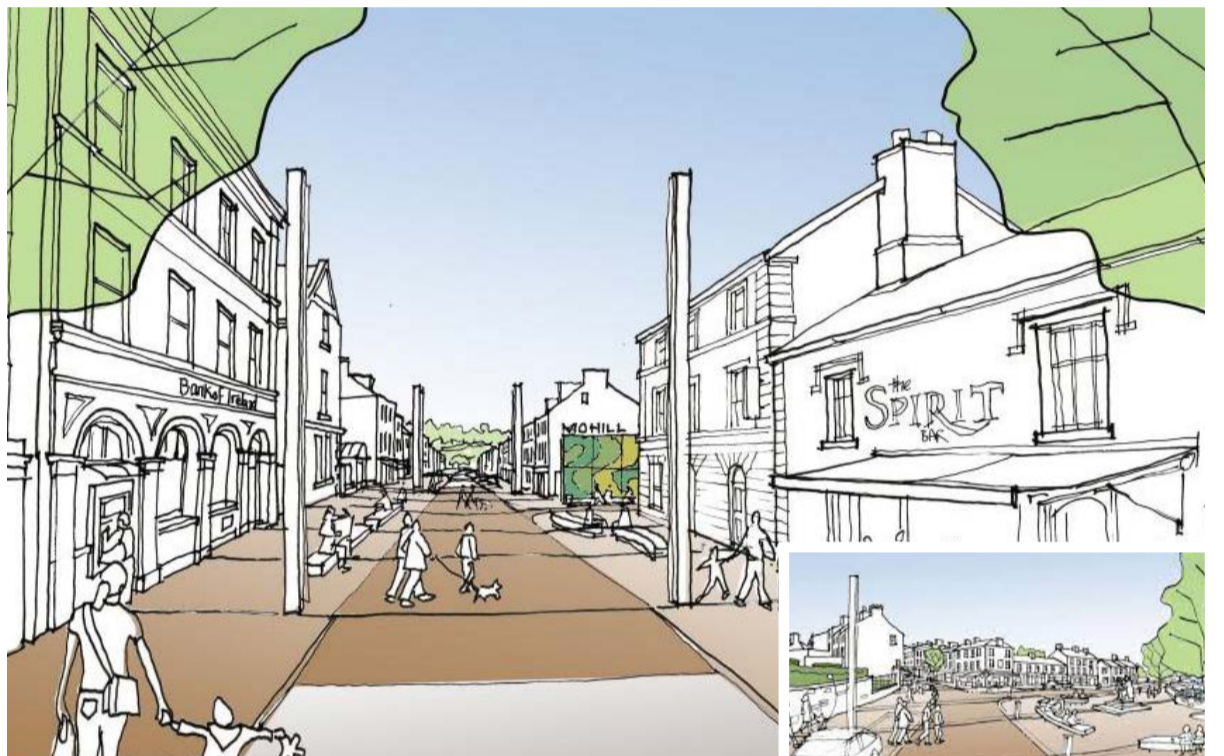
An artist's impression of Mohill's Public Realm works, Source: Leitrim County Council