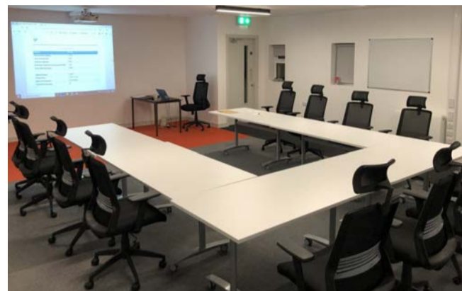
Mohill Enterprise Centre