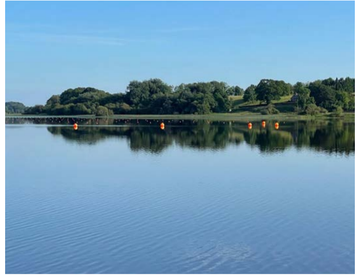
Image 1 & 3 courtesy of Mohill Town Team. Image 2, credit to photographer Mark Kelly.