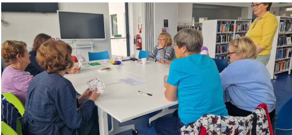
Bridge class at Mohill Library.

Follow Mohill Library on Facebook to stay up to date with library events: facebook.com/leitrimcountylibrary